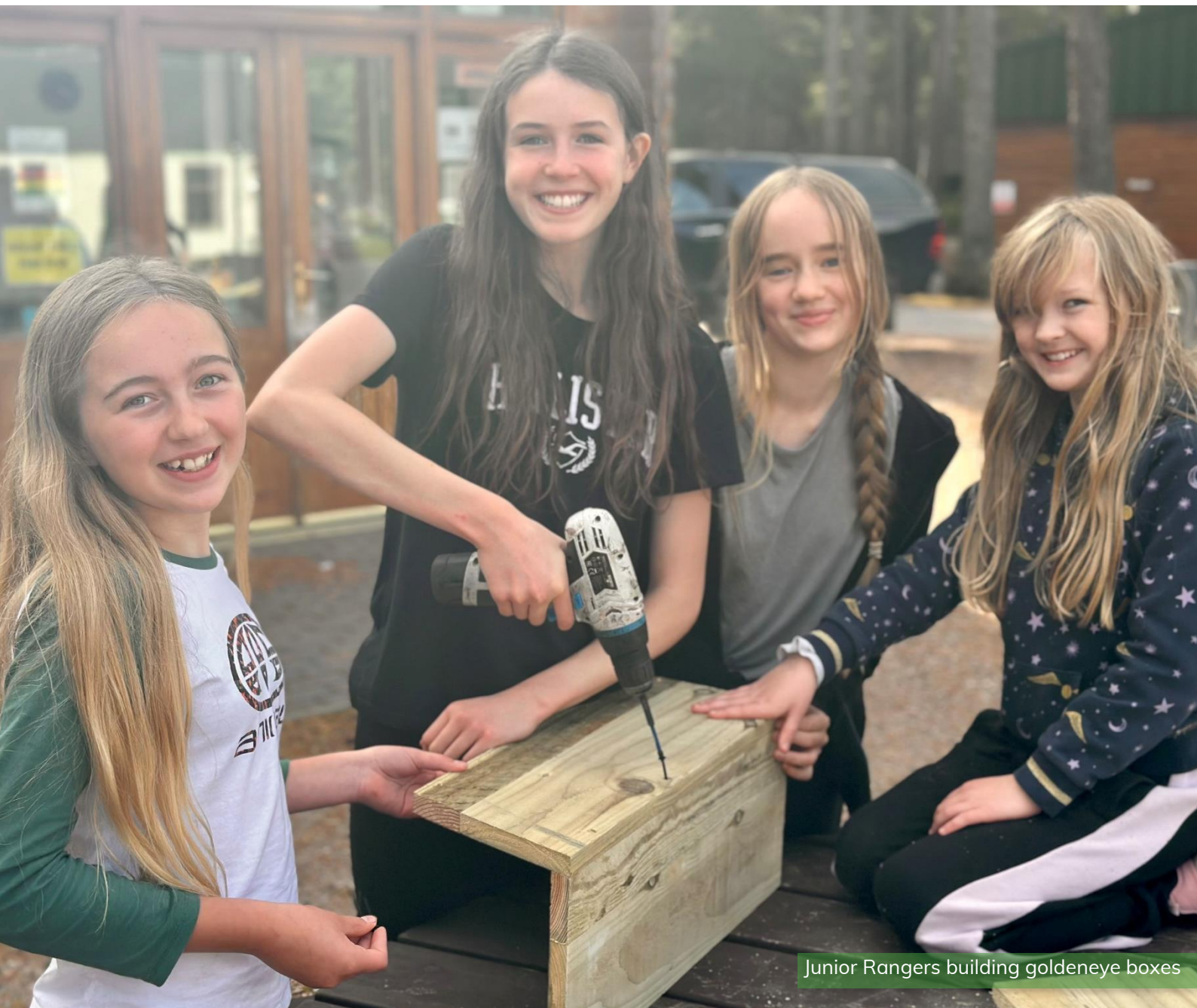
Junior Rangers building goldeneye boxes

With the support of dedicated partner Ranger Services and related professionals a varied programme of sessions has been delivered on weekends throughout the year. As the table on the following pages sets out, the sessions have given the Junior Rangers opportunities to develop their skills and knowledge across many topics whilst helping to look after the Cairngorms.