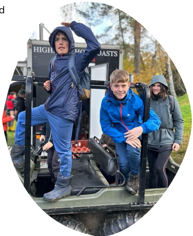
Above: Junior Rangers trying out kit used in deerstalking at Hill to Grill, a Cairngorms Connect community event

The project is a part of collective efforts to meet four of the National Park Partnership Plan objectives – B9 Mental and physical health, B10 Park for all, B11 Volunteering and outdoor learning and B4 Skills and training.