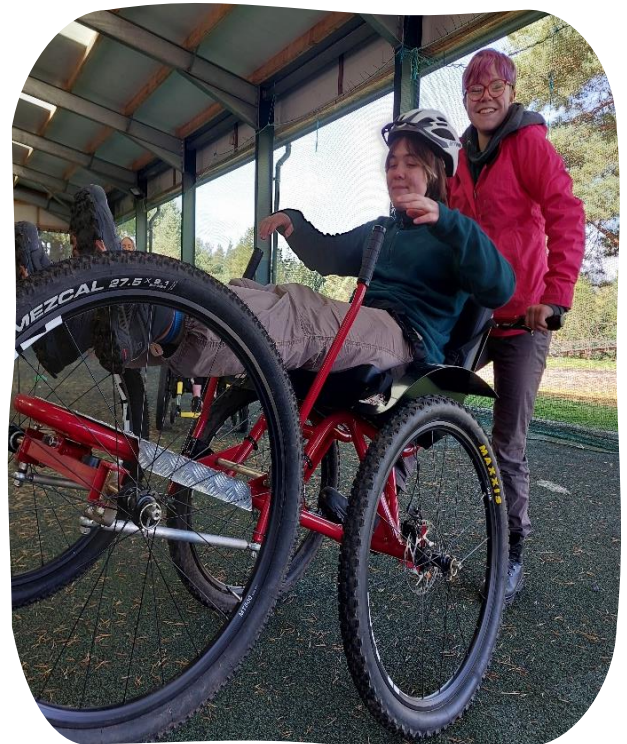
Top: all cheering together Left: creating a wildflower meadow Right: trying out off-road wheelchairs