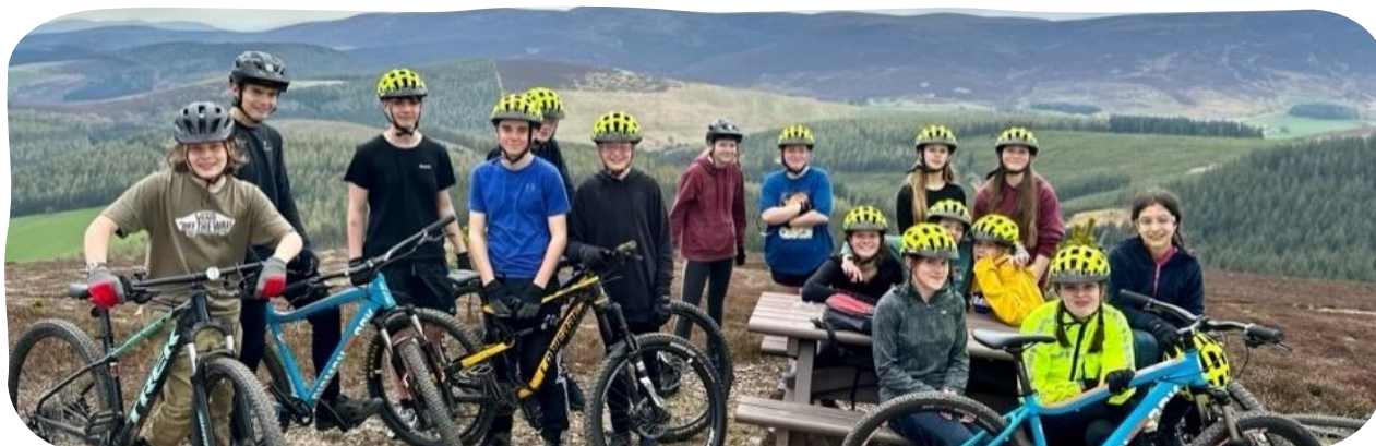
Grantown Grammar Junior Rangers mountain biking at Glenlivet