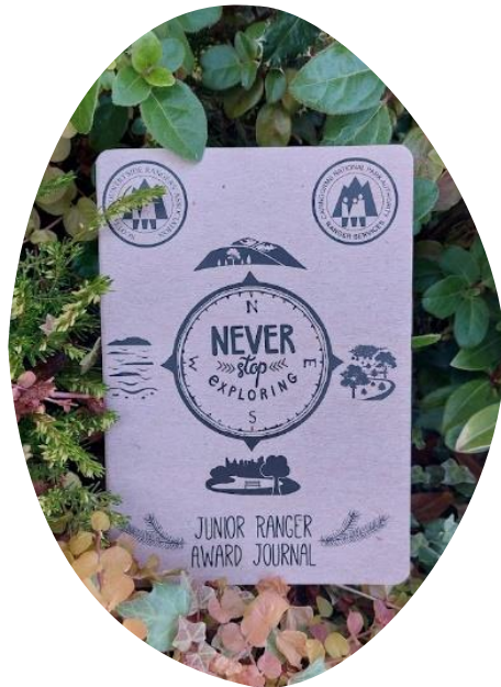
SCRA Junior Ranger Award journal

At the Junior Ranger camp this September we explained the Award and handed out journals to the Junior Rangers who wanted to work towards it. Since then, many of them have been diligently logging their Junior Ranger activity after every session and tracking their progress toward completing the Award.