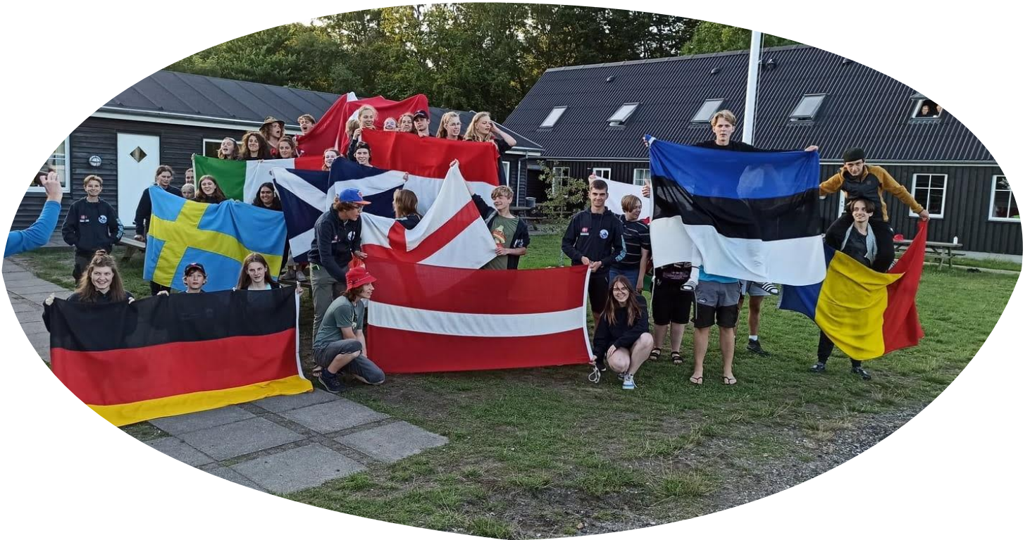
Junior Rangers from around Europe with their flags

We are connected to an interesting array of similar projects across Europe who are also based on the EUROPARC model of engaging young people in protected areas. Sharing experiences and knowledge is a key component of this model. So, after a hiatus due to Covid and a competitive application process, two excited Junior Rangers prepared a brilliant presentation and headed to northern Denmark for a week of discovery with Junior Rangers from 11 countries across Europe.