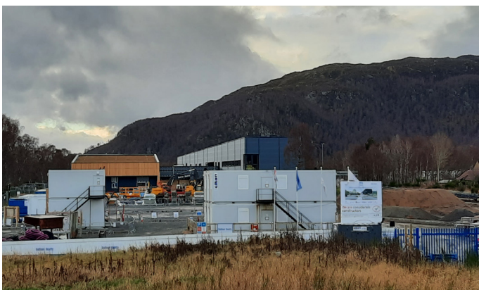
Image : Construction progress, December 2020

The New Speyside Distillery is taking shape in the landscape (image: top right). Gordon & MacPhail are a long established local company based in Moray. Following the success of the distillery operations at Forres, the company developed a project to open a new distillery and visitor facilities near Granttown-on-Spey. The development of a new distillery with associated cafe will deliver a range of benefits to the local economy including the creation of long-term employment opportunities for local people. Following the Planning Committee's decision to approve the distillery in October 2019, the Decision Notice was issued in June 2020 following the conclusion of a legal agreement that secures funding for an improved footpath link to Granttown-on-Spey and will help provide a safe link for walkers and cyclists between Dulnain Bridge and Granttown-on-Spey.