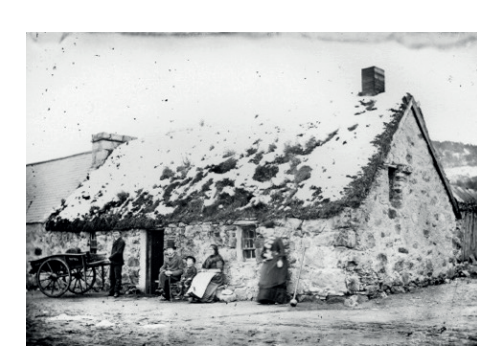
Castleton Terrace c. 1871