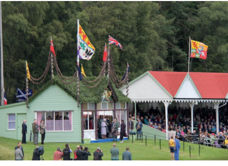
Highland Games Pavilion