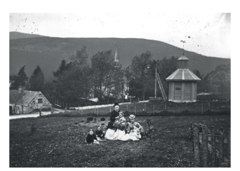
Castleton Terrace c. 1880