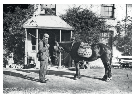
Hunting Party c. 1880