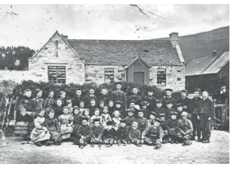
Braemar School c. 1896