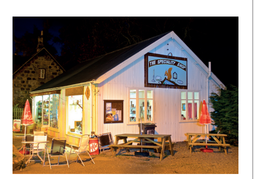
The Speciality Shop and Antique Shop

The community and visitors are well served by local services and shops with a garage and service station, pharmacist and newsagent, high class butcher, Co-operative store, art gallery, sporran maker, mountain sports shop, several cafes and around seven other shops offering a wide range of gifts, food and clothing. There is also an 18hole golf course, reputed to be the highest in Scotland, and the UK's largest skiing area, Glenshee Ski Centre, is just 10 miles away.