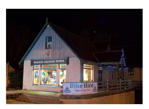
Braemar Mountain Sports