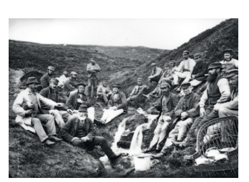
Hunting and Fishing Parties c. 1880