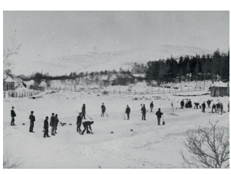
Corriefergie Curlers c. 1890s