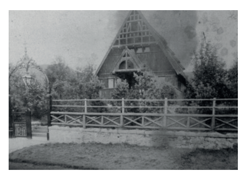
St. Margaret's Episcopal Church c. 1880