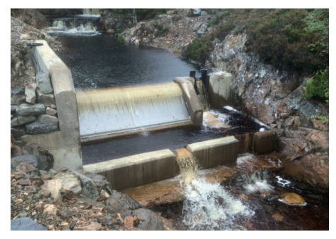
Braemar Micro Hydro Scheme