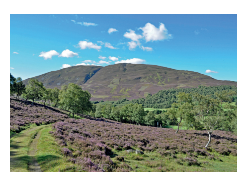
Queen's Drive Heather