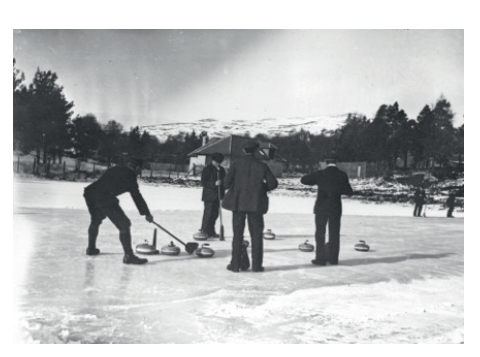
Braemar Curling c. 1890

increasingly classes for traditional music are offered and the Youth Club has been re-established.