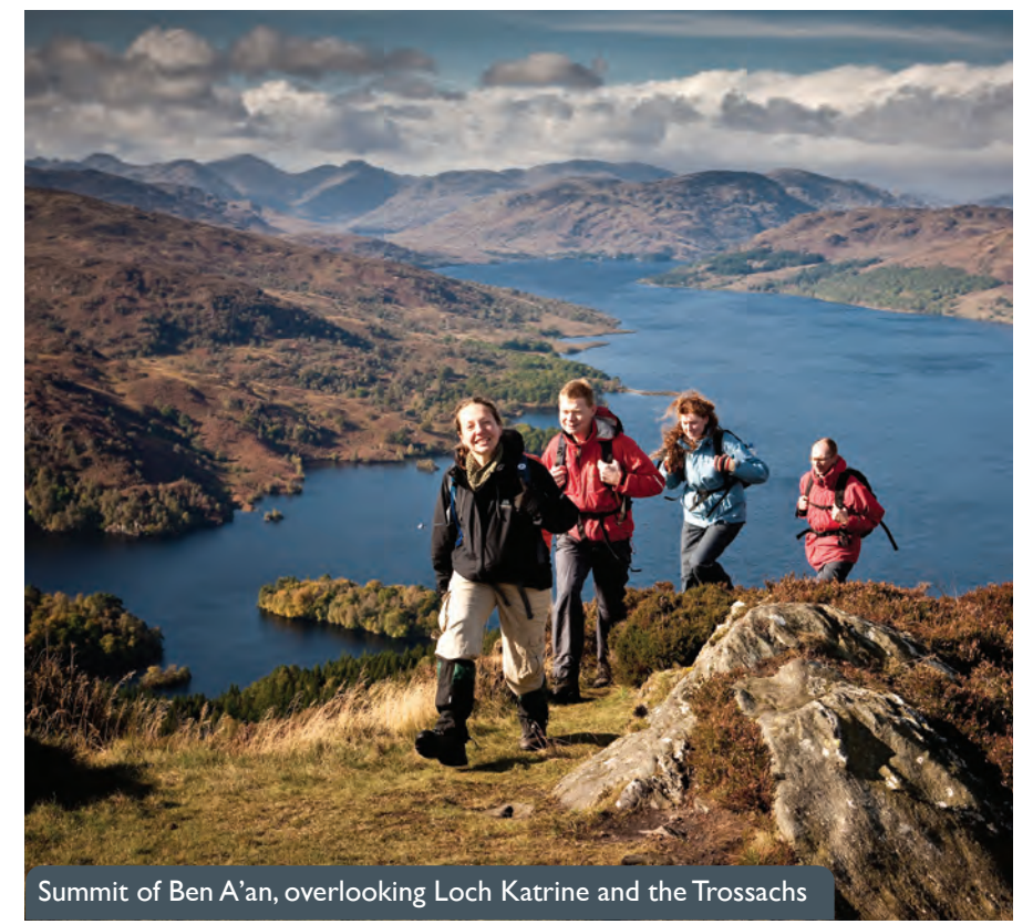
© Loch Lomond & The Trossachs National Park Authority