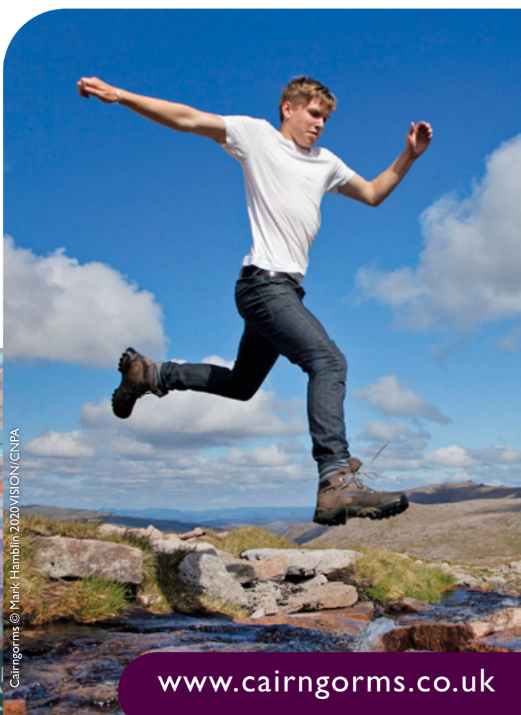
Cairngorms