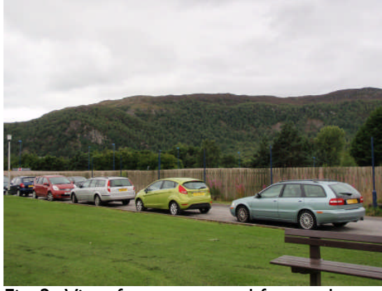
Fig. 2- View from area used for market