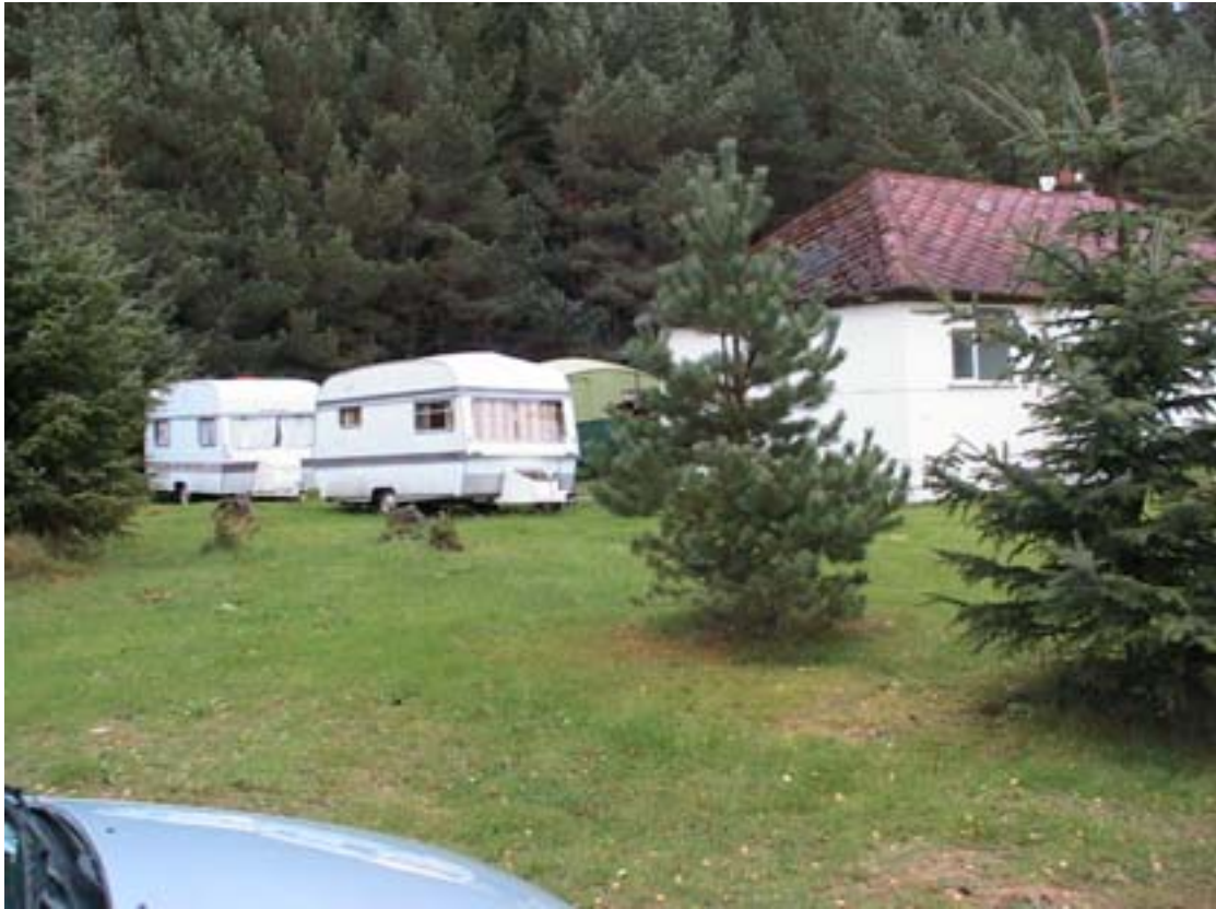
Fig. 3 – Existing Caravans