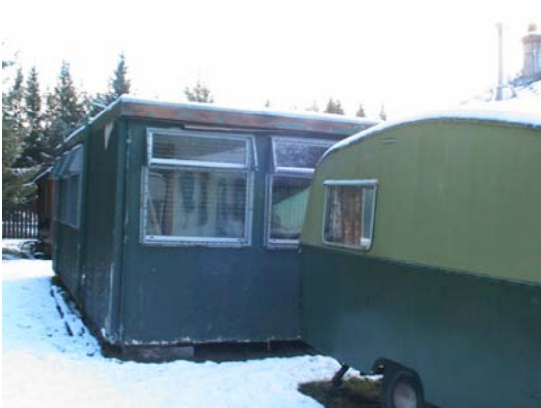
Fig. 4 – Existing Mobile Storage Unit