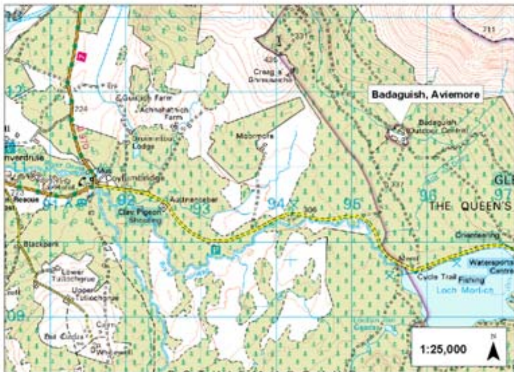
Fig. 1 - Location Plan