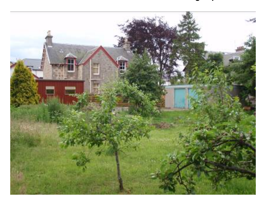
Fig. 4. Rear of "Shelter Stone" viewed from proposed site