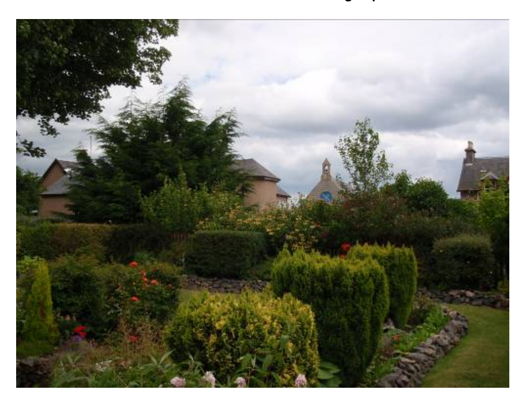
Fig. 8. Private garden area of No. 35 Craig-na-Gower Avenue – proposed flatted block positioned 3.5m from mutual boundary.