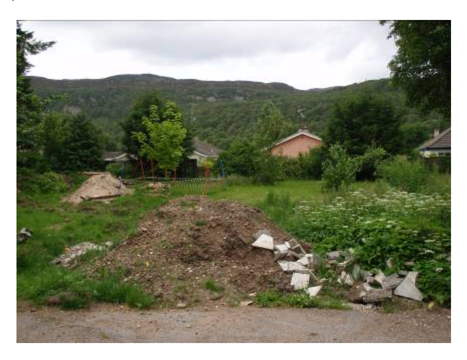
Fig. 3. Proposed site - garden area to rear of "Shelter Stone"

contemporary in design and character and has finishes of untreated timber cladding and white wet harl to the walls with a natural mill finish aluminium sheeting to the roof. Windows will be in aluminium frames and there are galvanised steel external access stairs and balconies to the upper floor flats. The roof pitch is shallow at 25 degrees and the total height to ridge is 8.8m. Externally, there is a communal garden and amenity area, and 8 no. car parking spaces finished in lockblock or gravel. The double garage will be demolished. Following discussions with Highland Council Roads, a revised access proposal involves an upgrade of the joint access. This will necessitate the removal of the modern "Shelter Stone Bothy" building adjoining the main house. Also shown here is the addition of 4 no. optional parking spaces.