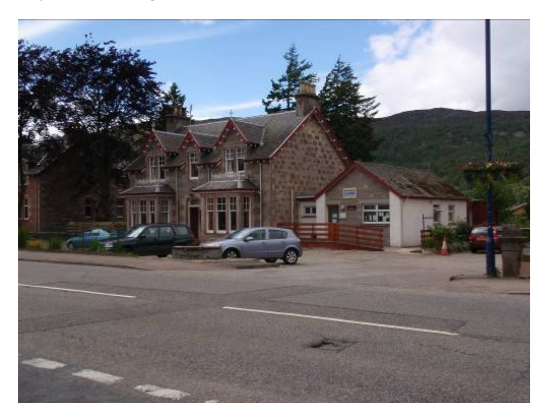
Fig. 2. "Shelter Stone" viewed from Grampian Road

1. This property is located on the west side of Grampian Road in Aviemore, to the north of the main commercial core of the settlement. The existing building, known as "Shelter Stone", is a Category C(s) Listed Building. It is 1¾ storeys in height and of traditional build with stone and slate finishes and a symmetrical front elevation with dormer and bay windows. On its north side and adjoining the existing building is a modern single storey addition ("Shelter Stone Bothy"), and to the rear is a flat roofed double garage. A sizeable garden area is situated to the rear. There is an open access on the north side that is shared with the adjacent Alt-na-Craig Hotel. There are some mature trees on the south rear boundary but these are located in the adjacent property. Over the rear boundary on the west side are semidetached single storey properties in Craig-na-Gower Avenue. Nos. 35 and 37 have their private rear garden areas immediately adjacent to the garden area of "Shelter Stone".