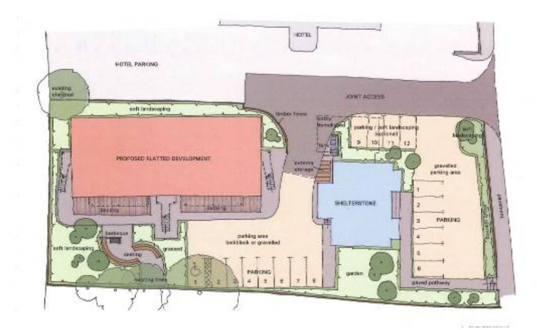
Fig. 7. Revised Site Layout Plan