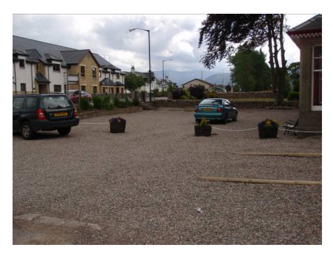
Fig.5. Front of "Shelter Stone" - new parking area created

3. Part of the application includes the formation of a hardstanding parking area to the front of "Shelter Stone" adjacent to Grampian Road. This proposal is <u>retrospective</u>. An expanse of gravelled parking area has already been formed in this part of the site and the drawings indicate the provision of 6 no. spaces here.