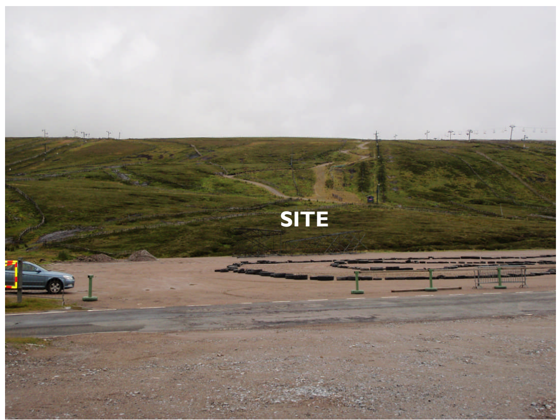
Figure. 3- View of site from the south end of the Lecht car park