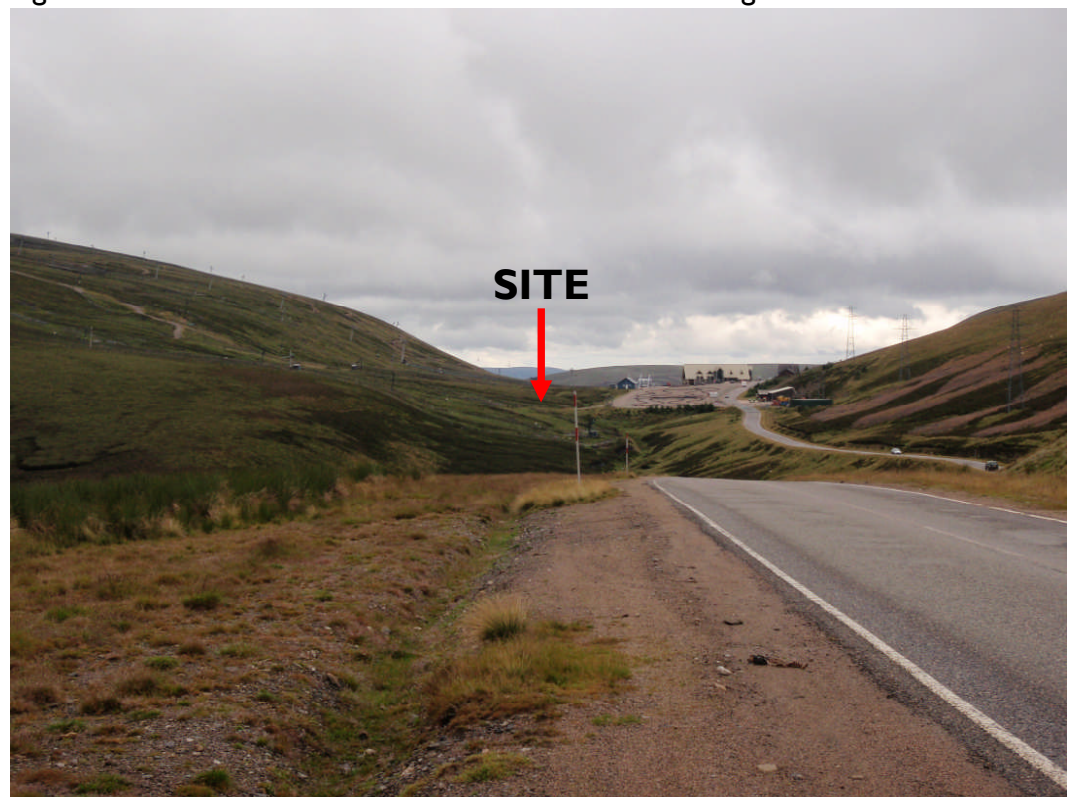
Figure. 3- View of site from A939 to the south of the Lecht