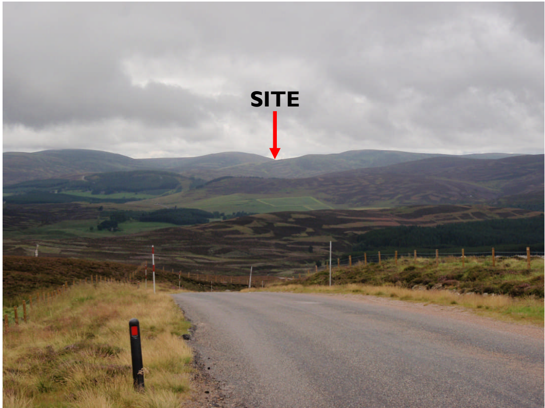
Figure. 2- Distant view of site from the A939 above Corgarff