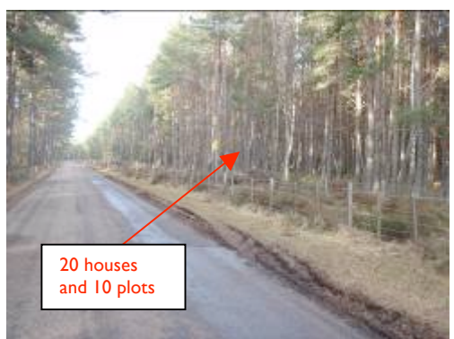
Fig. 8 : School Road

The applicants were also advised in that letter that no comment was being made at that stage on the design of the proposed residential units or the business units, as significant modifications to the overall proposal were likely to result from the other required amendments and consequently further comment would be made on design issues at a later stage when assessing the revised proposals.