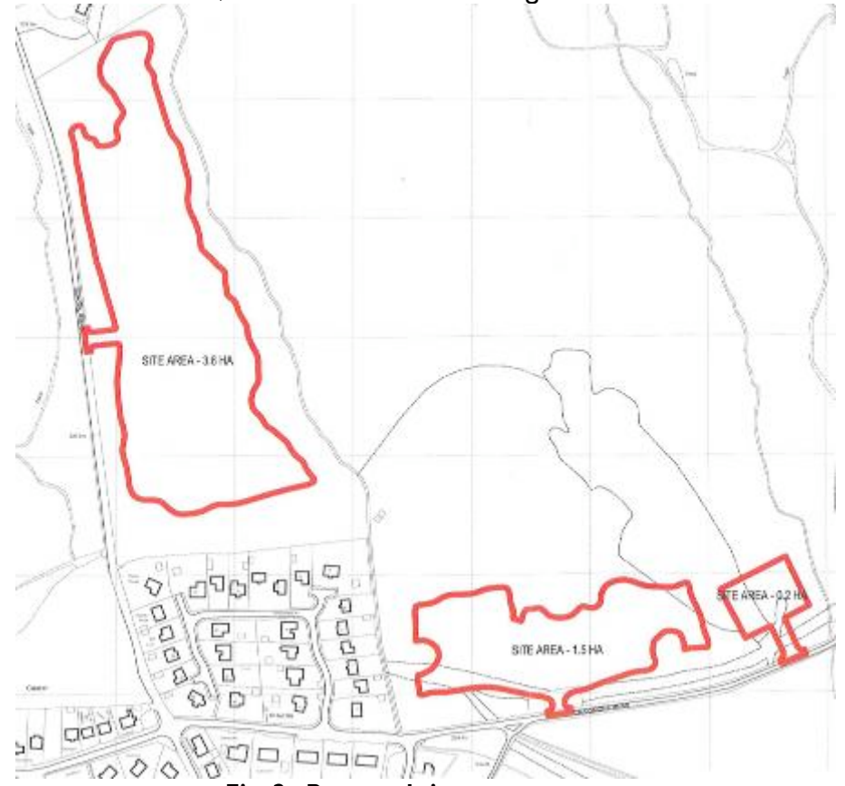
Fig. 2: Proposed site areas