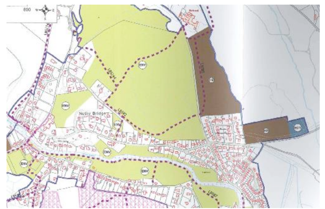
Fig. 10: Extract from the Nethy Bridge Settlement Proposals Map (CNP Local Plan 2010)