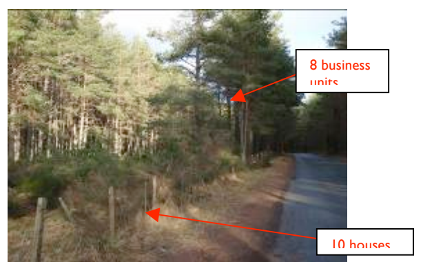
Fig. 9: Craigmore Road

14. A letter was received from the agent on 12 January 2010 in response to the CNPA request. That letter was described by its author as an 'interim response' pending further consideration by the applicants in the context of the outline consent granted. It was indicated that the applicants were considering the various requests. Since that time, no further information has been received, other than the applicant's periodic written agreement to extend the time period for determination.