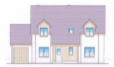
Fig. 6: House Type B