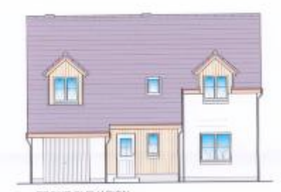
Fig. 5: House Type A

8. House type A is a dormer design of one and three quarter storeys. It includes three bedrooms on the upper floor, with all living accommodation located on the ground floor. The design also incorporates an integral garage within the main body of the house, with the vehicular opening contained in the front elevation. House type B is also a one and three quarter storey dormer design, including four bedrooms, of which one is to be located on the ground floor. It includes an attached garage which is proposed to be accommodated to the side of the dwelling. Two versions of House Type D are proposed, the first of which includes a garage attached to the side of the main body of the house, and set back from the front building line. The second version of House type D (identified as D(CP)) includes a garage and a car port to the side elevation of the dwelling house. Similar to House type B, this house type also accommodates four bedrooms, with one of those being at ground floor level. House types A, B and D generally feature traditional, conventional elevations, and include features such as traditional pitched roof dormers, and front entrances emphasised by the use of timber cladding in the vicinity. Types A, B or D do not include any provision for chimneys.