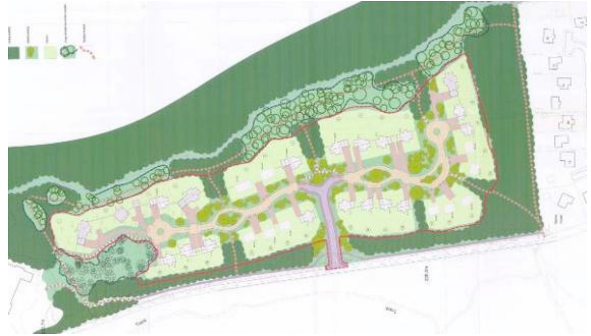
Fig. 3: Proposed layout - School Road

5. The second site area included in this application is the proposed residential component which lies adjacent to Craigmore Road. Similar to the arrangement of the larger site on School Road, the site area is set back from the public road (with the exception of the proposed vehicular access). The majority of the site currently forms part of the woodland area and also