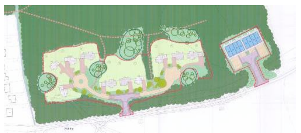
Fig. 4: Proposed residential and business unit layout - Craigmore Road

includes an existing small clearing close to the public road. A total of 10 detached dwelling houses are proposed on the site, four of which would be located in the western area of the site with individual accesses coming off a roundabout at the end of the access road; three dwellings would be centrally positioned close to the access off the public road; and the remaining three units would be positioned in the eastern area of the site in a similar arrangement to the western side, where individual accesses are proposed off a turning area.